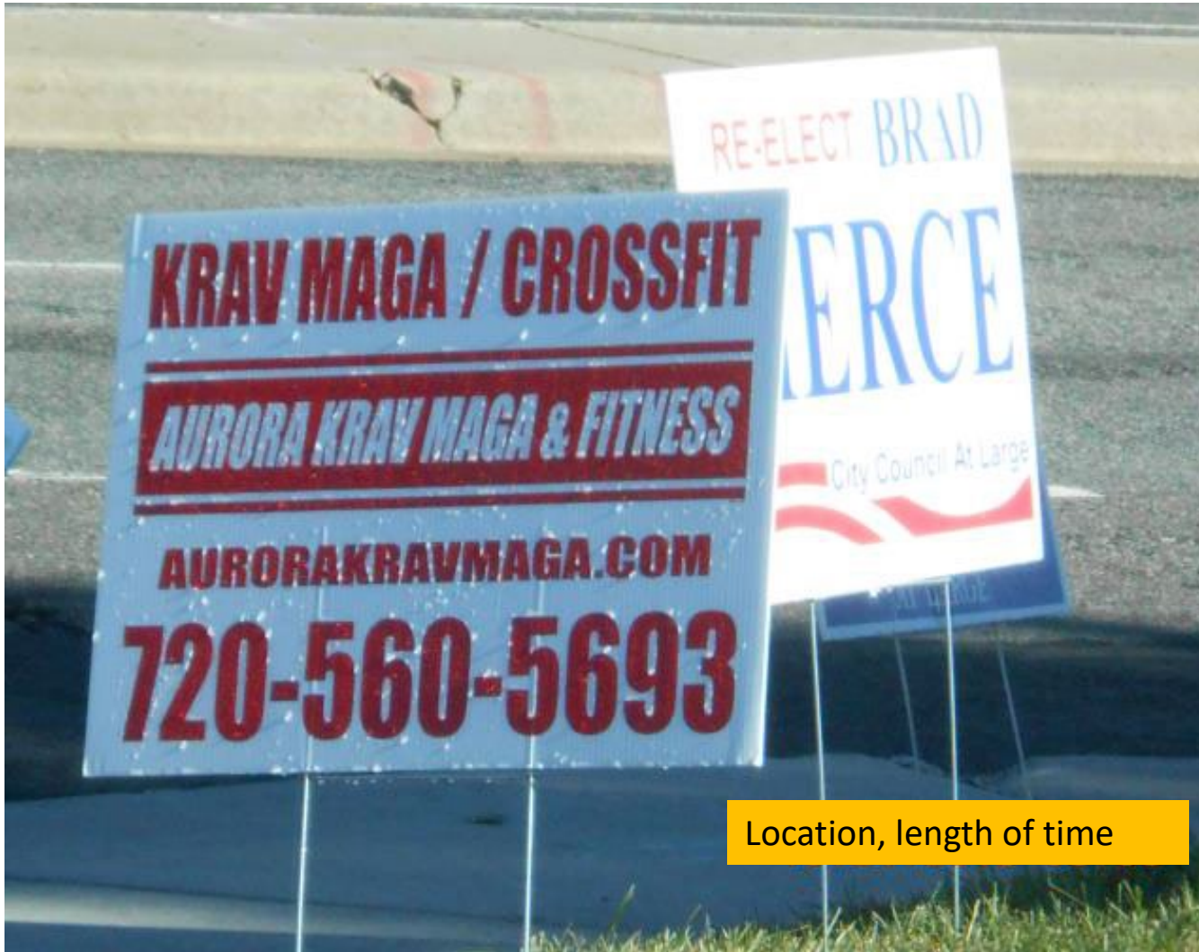
Location, length of time