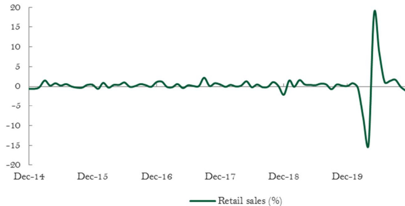
Chart 2: Retail sales move into contractionary territory