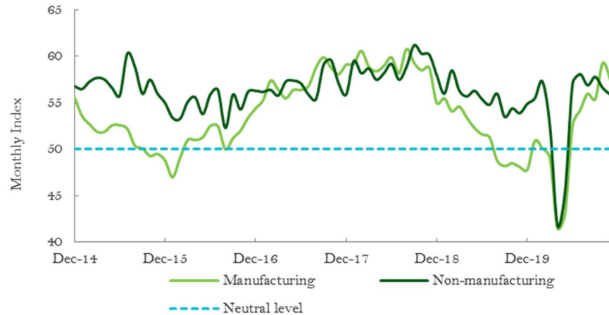
Chart 1: ISM indices remain in expansionary territory but soften