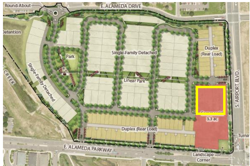
Figure 1 East Creek Master Plan

The proposed site is located at the northwest corner of East Alameda Parkway and Airport Boulevard as part of the recently approved East Creek Development (Planning Commission approval December 2017) and immediately north of the recently constructed "7-11" convenience store and fueling station. The vacant site is approximately 1.5 acres and is surrounded by streets on all four sides. To the west are planned single-family homes as part of the residential component of East Creek. Two homes face the carwash, and the side of a house faces the retail building. None of the homes are built. This proposal includes primary access from Virginia Avenue on the south and Alaska Avenue on the north.